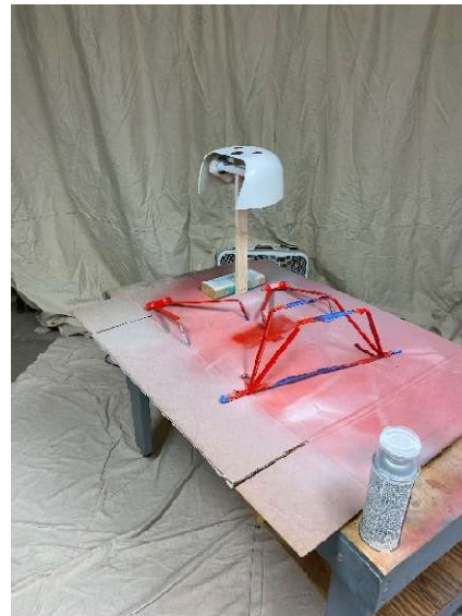
I painted the parts but asked Wayne if he would come over and spray the clearcoat.