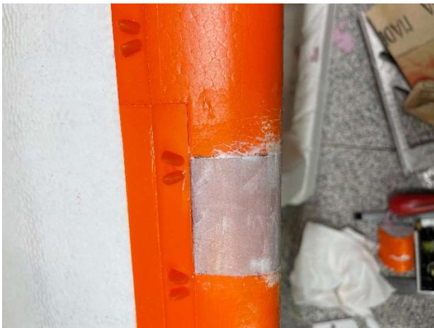
Here you see the sanded down repair spot that is ready to paint.