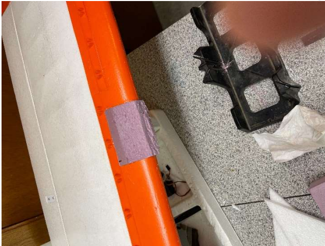
This picture shows the oversized piece of foam now glued in place.